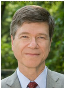
Jeffrey Sachs | Director, The Earth Institute - Columbia University Speaker Bioeconomy and the Grand Challenges