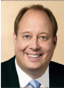
Helge Braun | Minister of State to the German Chancellor Speaker Bioeconomy and the Grand Challenges

Helge Braun has been Minister of State to the Federal Chancellor since December 2013. Four years before he held the position of the Parliamentary State Secretary to the Federal Minister of Education and Research. Since 2009, Mr. Braun has been a member of the German Bundestag (also from 2002 to 2005: Committee on Education, Research and Technology Assessment and Committee on the Environment, Nature Conservation and Nuclear Safety). Before starting his political career, Mr. Braun worked as a doctor.