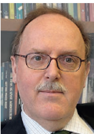
Joachim v. Braun Chair, German Bioeconomy Council

As Bioeconomy combines far-reaching ambition with regional adaptation, there will be no such thing as a singular bioeconomy but rather a plurality varieties. Realizing the rich potentials of bioeconomy requires a common understanding of its foundations and perspectives. International dialogue is needed to define and guide bioeconomy in the context of related or competing notions and interests, for instance with regard to holistic concepts of biological resources or unique features such as carbon neutrality, renewability, re-usability and multi-functionality.